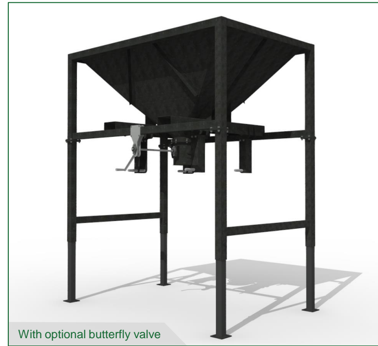
With optional butterfly valve