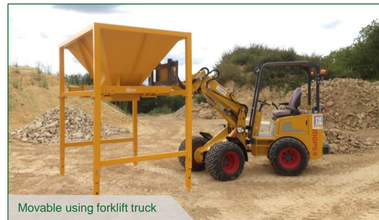
Movable using forklift truck