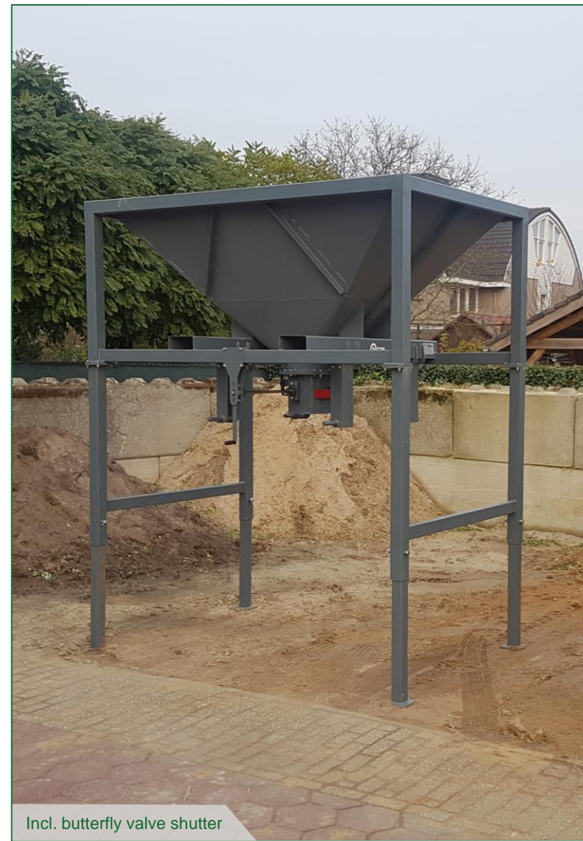
Incl. butterfly valve shutter