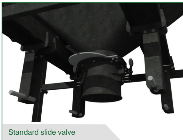
Standard slide valve