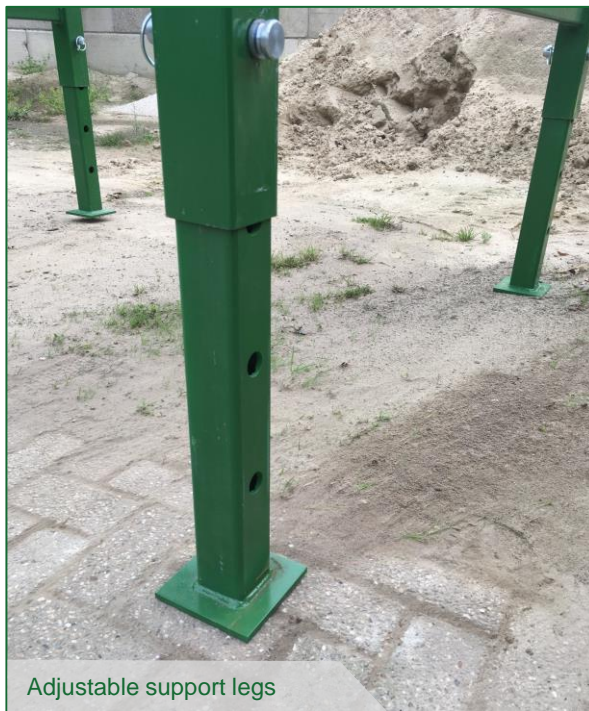
Adjustable support legs