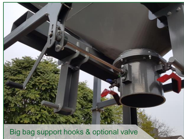
Big bag support hooks & optional valve